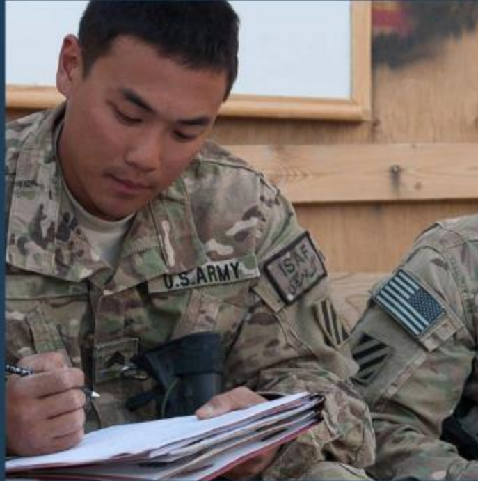
VA Benefits and Services