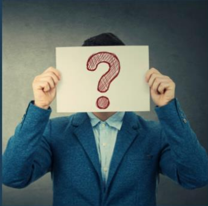
DoD Transition Day