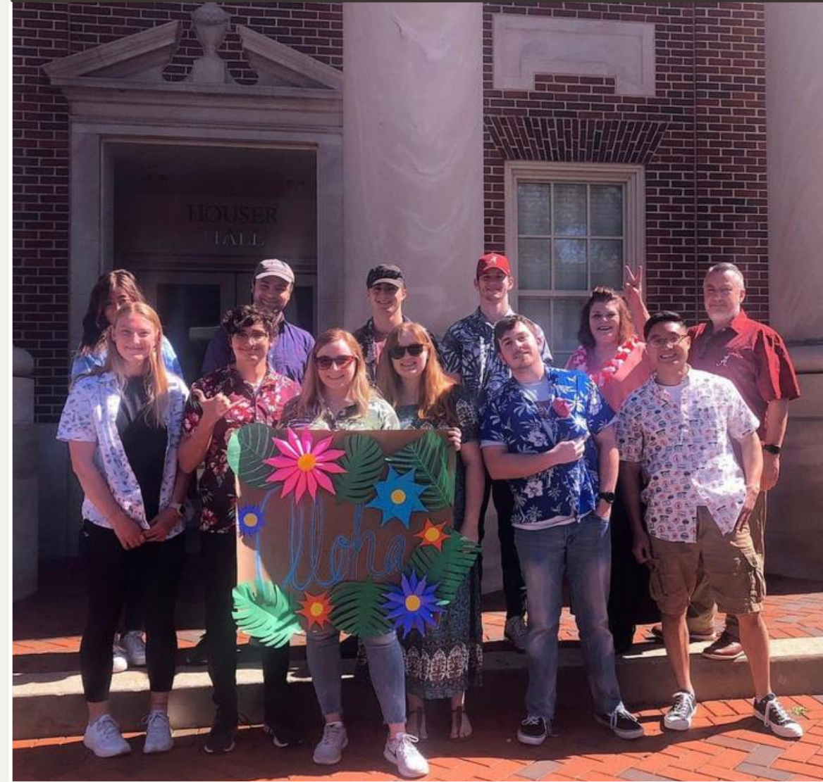
HAWAIIAN SHIRT THURSDAYS!