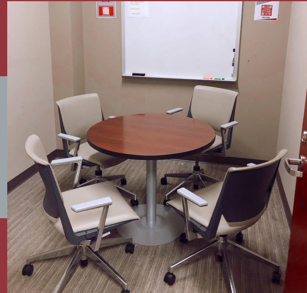
PRIVATE STUDY ROOMS