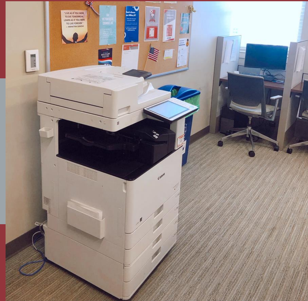
FREE PRINTING TO STUDENTS