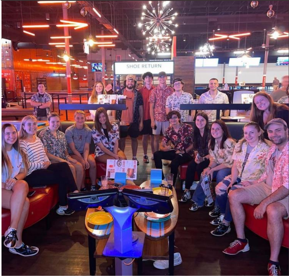
TEAM BONDING BOWLING NIGHT!